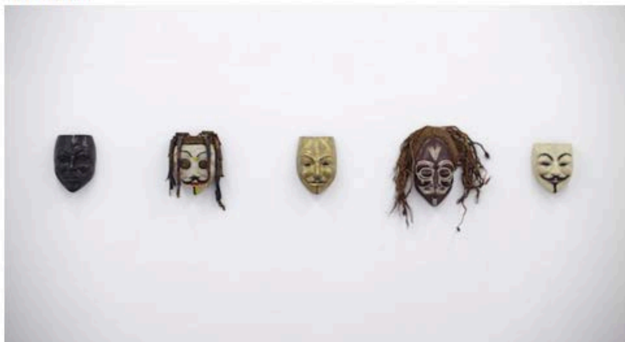
Dan Halter, V for Vendetta, African masks, dimensions variable, 2014.

One of many Zimbabwean immigrants living in South Africa, Dan Halter's work at The Armory Show is centered around the concept of migration. With tapestries and a massive sculpture stitched together from large plastic bags used to carry valuables across the Zimbabwe-South Africa border, Halter makes a statement about nature of migration. A massive map of the world is revealed to be an infographic—countries whose populations are on the move are cut from weathered plastic bags, while their destinations are shiny and new. An assemblage of Guy Fawkes masks crafted in the styles of different African tribes parodies both trendiness of cultural artifacts in the markets of Cape Town and the empty promises of the Occupy movement, whose most recognizable symbol has been reduced to simple product and profit.