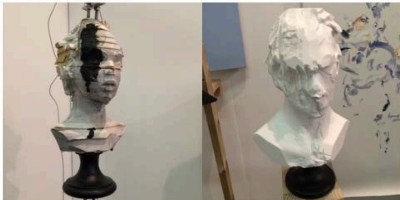
Wim Botha, Busts, 2016. Photo by the author